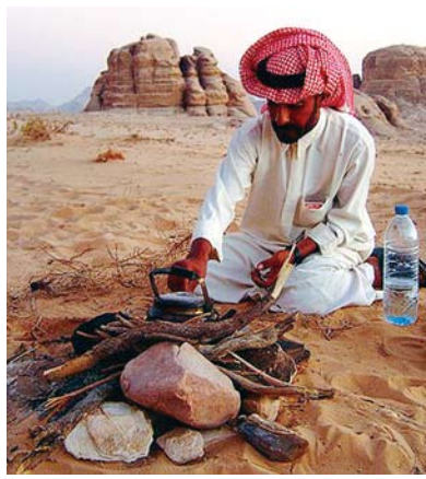
A Bedouin Man Lighting a Fire in Wadi Rum

Some Transjordanians highlight their Bedouin ties to distinguish themselves from other groups in Jordan, particularly Palestinians. The state has made an effort to connect tribal and Bedouin identity to Jordan’s heritage. The Bedouin, typically desert and tent-dwelling semi-nomadic or nomadic