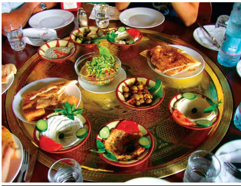
A Platter of Mezes (Appetizers)

chickens and varieties of fruits and vegetables are common foods, as are salads, stews, and dips. Many East Bank Jordanians of village or Bedouin origin do not eat fish.