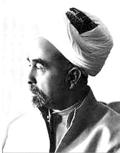
Abdullah bin Hussein: Emir of Transjordan (1921–1946), King of Jordan (1946–1951)

state consolidated its authority by building infrastructure, developing a governing bureaucracy, and expanding state services. In rural agrarian areas, the state extended its control through a massive land registration and taxation program that began in 1927. Government employees involved in registration and taxation became visible representatives of the state. State courts had authority to determine land ownership. It was more difficult for the state to control the tribal periphery, particularly in the southern regions of Jordan.