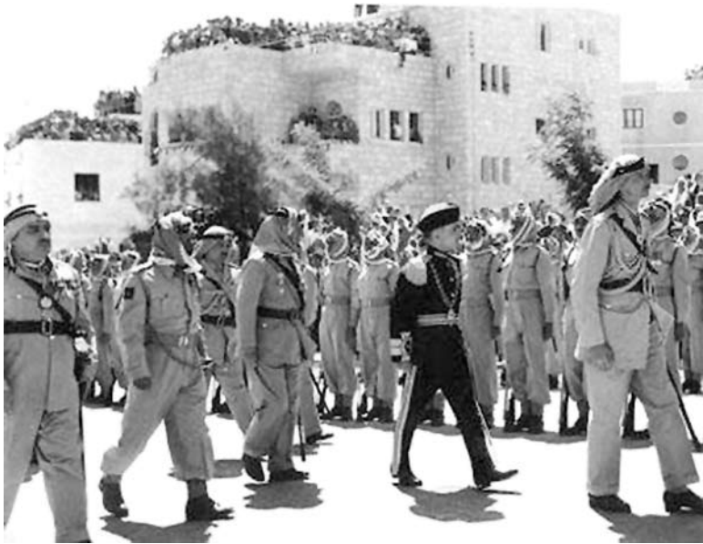
King Hussein Walks to the Parliament Building before the Throne Ceremony, 11 April 1952

Many Palestinians believed that Abdullah's actions undermined the Palestinians' ability to acquire independence and autonomy. On 20 June 1950, while entering the al-Aqsa Mosque in Jerusalem, Abdullah was assassinated by a young Palestinian. Abdullah's son Talal ruled for a brief period. He was popular due to his efforts of legislative and constitutional reform and his perceived resistance to the continued British presence in the country. However, he suffered from mental illness and was deemed unfit to rule in 1952. On 18 May 1953, Talal's son Hussein became king. Only 18 years of age, Hussein initially had a difficult time establishing his authority. His most significant threat came from other Arab states, such as Egypt, whose leaders espoused Arab nationalism. Arab nationalism reso-