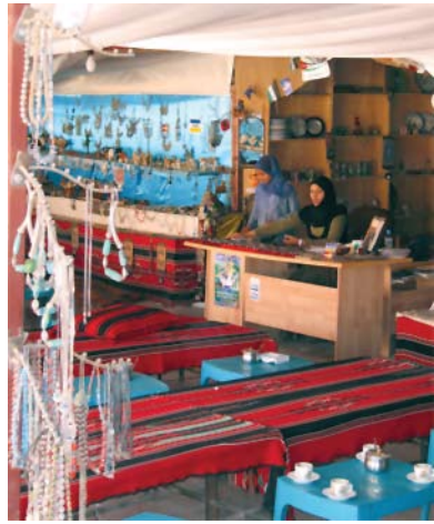
Merchants in a Petra Market

The family and the tribe are traditional sources of protection, education, health care, and economic aid in Jordan. As the central government expanded, it assumed a leading role in providing these and other services to the population. The Jordanian welfare state created a relatively healthy, well-educated population with increasing economic aspirations.