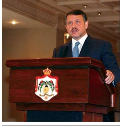
King Abdullah II

echoing popular sentiment within Jordan. However, he has been supportive of U.S. forces, allowing them to use Jordan's bases in the desert. Abdullah's support of the United States has sparked popular opposition, prompting him to limit political freedoms and postpone elections for a number of years. As a result of the war in Iraq, the U.S.-Jordan relationship is increasing in value to both countries, demonstrated by increasing levels of U.S. aid to Jordan since 2003 and the presence of Qualified Industrial Zones (QIZs), or U.S. duty and tax-free production and export areas, in Jordan. The war has also decreased political and economic stability in the region. Jordan witnessed the effects of this in 2005, when 2 hotel bombings in Amman killed 60 people. The government has responded to attacks by suppressing extremist activities.