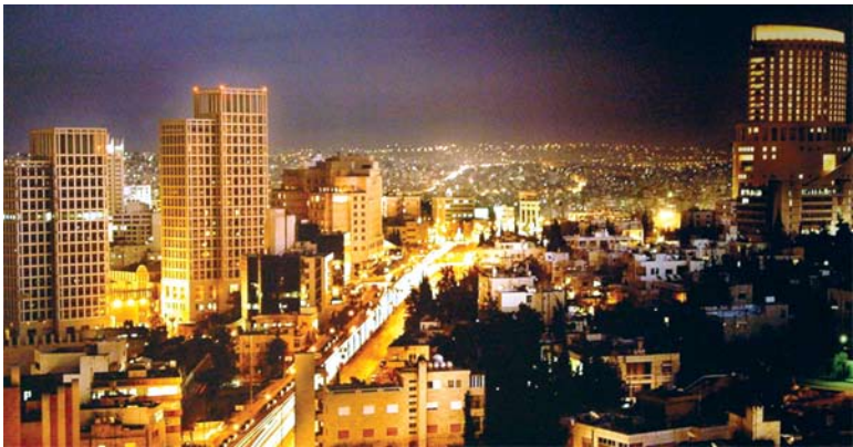
Amman at Night

An estimated 1.8 million registered Palestinian refugees live in Jordan; most live in urban areas, particularly in greater Amman. Approximately 300,000 refugees live in refugee camps established by the United Nations. Over time, these camps integrated into surrounding cities. Many camp residents have divided loyalty between