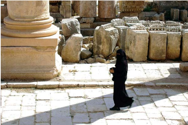
A Woman in Islamic Dress in Petra

Most Jordanian men wear modest, Western-style clothing, such as jeans and shirts. In urban settings, Bedouin men also wear Western-style clothing, but in private settings Bedouin men wear