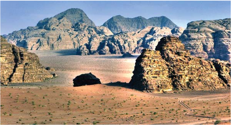
Wadi Rum in Southwest Jordan

Foreign workers are also a significant part of Jordan's society. Most foreign workers come from Egypt; however, there are also large numbers of workers from Pakistan and the Philippines. Foreign workers fill low-wage positions throughout Jordan. It is estimated that female migrant workers in the domestic sector in