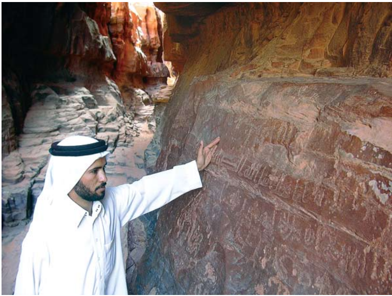
Jordan Man Viewing Cave Writings

Tribal elites' identity is not based on nostalgia for tribes' past autonomy, as it is with some other tribesmen. The Jordanian state could consider nostalgia for an autonomous tribal past as a challenge to the state's authority. Elites do not want to jeopardize their positions within the state. Tribal elites still identify with their constituencies, with whom they share kinship ties, because these connections make the elites valuable to the state.