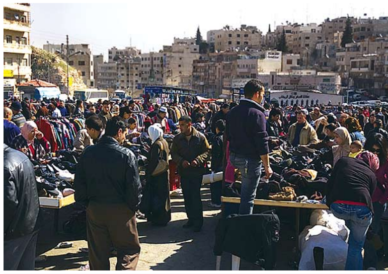
A Marketplace in Jordan