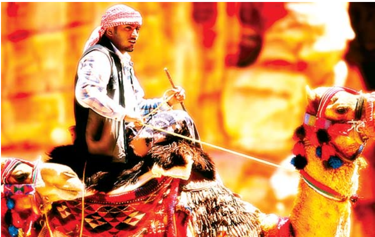
Modern Bedouin

Palestinian identity within Jordan is complex. The notion of a single Palestinian identity or community overshadows meaningful differences that are felt by Palestinians. Significant distinctions among Palestinians include those arriving in 1948 versus 1967, Gulf War refugees, camp residents and property owners, and class