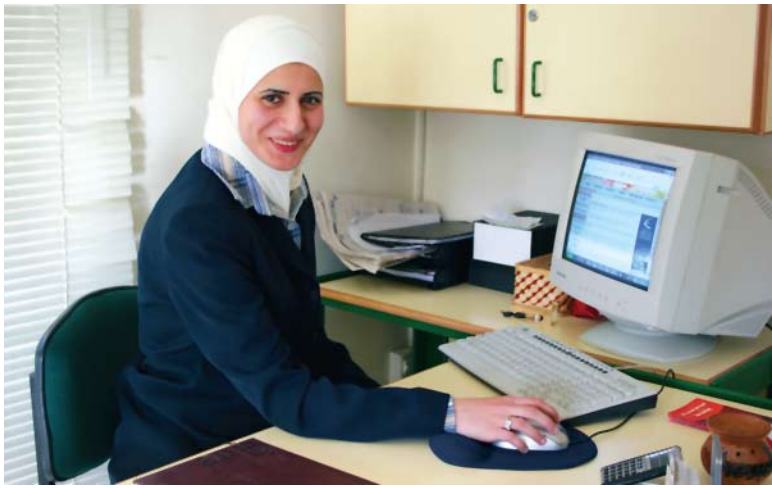
A Woman Runs a Web Design Business in Amman

In 1991, Iraq's invasion of Kuwait also affected Jordan's economy and society. In part due to economic considerations, Jordan remained neutral during the war. During the 1980s, Jordan and Iraq had become strong economic and political allies. Jordan relied on Iraq's oil, aid, and trade for a large percentage of the country's gross domestic product (GDP). Jordan's neutrality was popular within Jordan; many Jordanians supported Saddam Hussein's resistance to Western powers. However, Jordan's neutrality angered its conservative Arab and Western allies. These allies, including the United