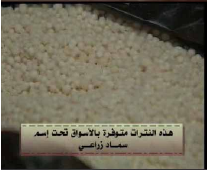
هذه النترات متوفرة بالأسواق تحت اسم سماد زراعي