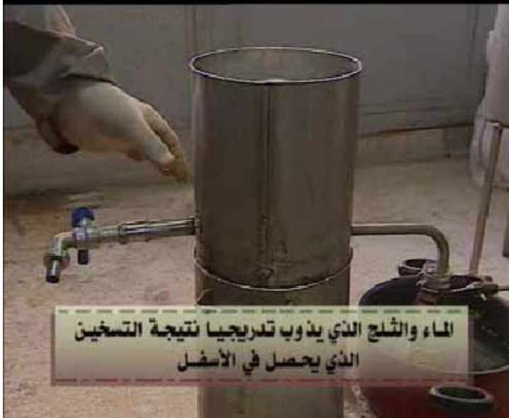
الماء والثلج الذي يذوب تدريجياً نتيجة التسخين الذي يحصل في الأسفل