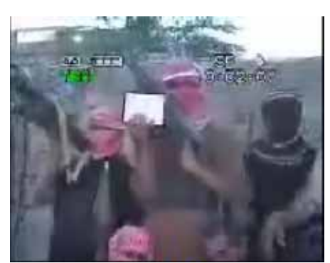
The terrorists sentence the hostage to death, holding up a copy of the Koran.