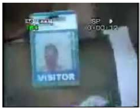
The name on the badge is too blurry to read.